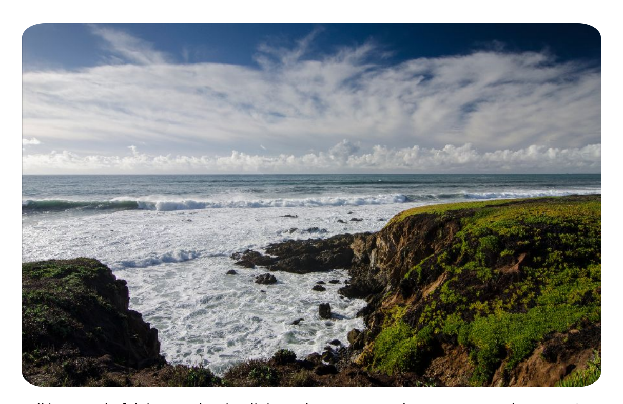
Fall is a wonderful time on the Fiscalini Ranch Preserve. We hope to see you there soon!