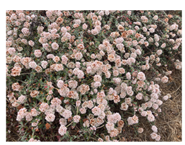
Sea cliff buckwheat Eriogonum parvifolium