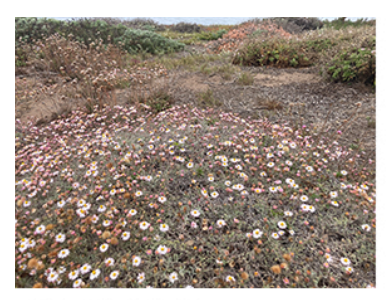
California sandaster Corethrogyne filaginifolia