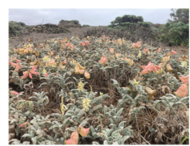
Ocean bluff milk vetch Astragalus nuttallii

Over the last two years, Friends of the Fiscalini Ranch Preserve has been working with Cambria Community Services District to restore native vegetation on the Bluff Trail. Our bluffs are graced with the blooms of coastal bush lupine ( Lupinus arboreus ), seaside daisy ( Erigeron glaucus ), sea pink ( Armeria maritima ), sea cliff buckwheat ( Eriogonum parvifolium ), seaside woolly sunflower ( Eriophyllum staechadifolium ), sky lupine ( Lupinus nanus ), and seaside fiddleneck ( Amsinckia spectabilis ) to name a few.