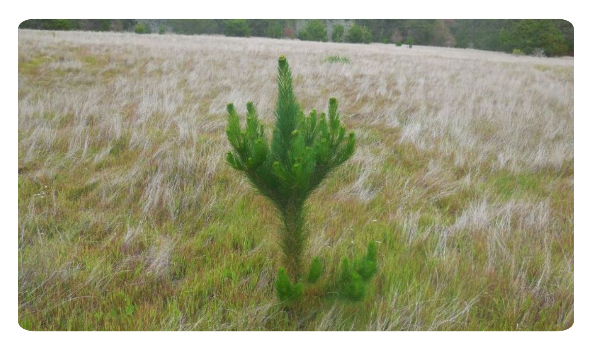
How to Plant for Ranch Conservation:

No reservations are necessary. Meet near the Dolphin Bench on the Ridge Trail. We will provide basic supplies. Sturdy shoes, long pants, and tick spray are recommended.